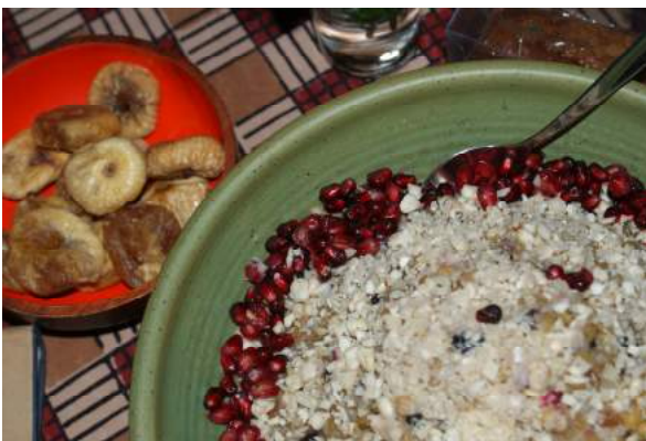
Dish of Ashure, traditionally served at Tu B'Shevat