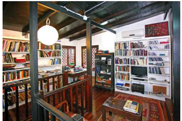
Jennifer Stein Memorial Library, major Ezzrath Nashim