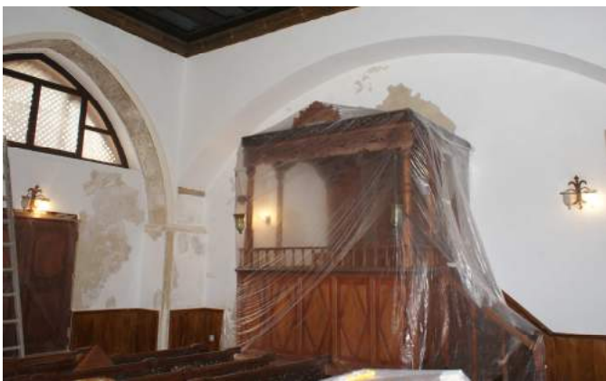
Renovation works, Etz Hayyim interior, February 2016

In July 2016, three Bar Mitzvahs are scheduled to take place at Etz Hayyim.