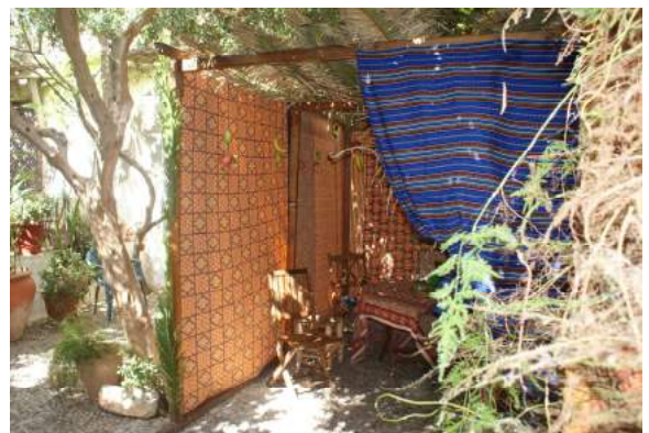
Sukkah in the Etz Hayyim courtyard